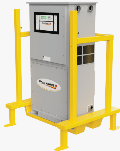
Example Charger Cart with Cable Wrap Poles and Charger Cart Legs Installed